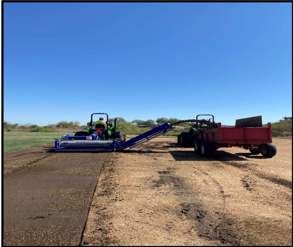
Frase mowing #1 fairway