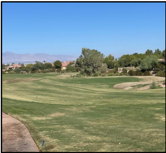
#12 fairway grassed.