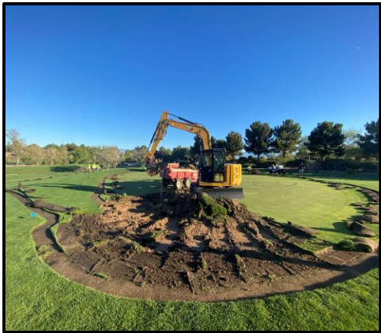
Coring out North chipping green.