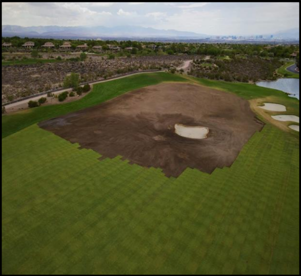
Fairway #9 grassed.