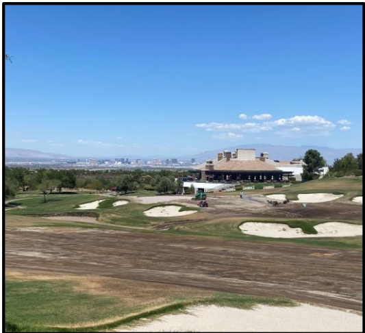
Installing greensmix in #18 green.