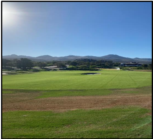
#9 fairway grow in progress.