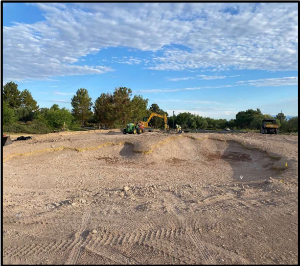
Right side bunker on #5 green complex