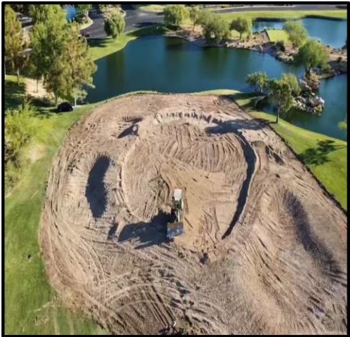
New green complex on hole #5.