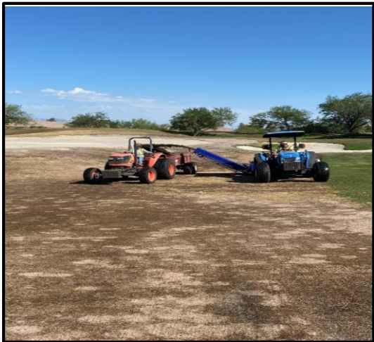
Fraze mowing on #11.