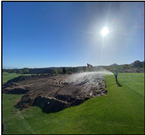
Watering and compacting driving range tee