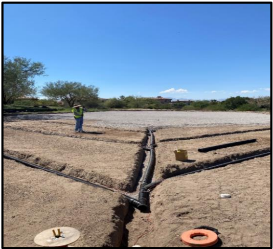
Putting green being drained.