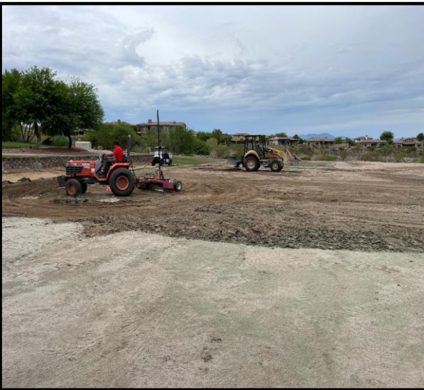
Laser leveling driving range tee.