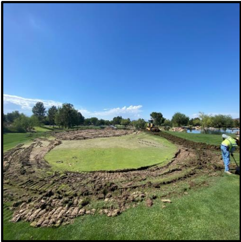
Stripping #5 green.