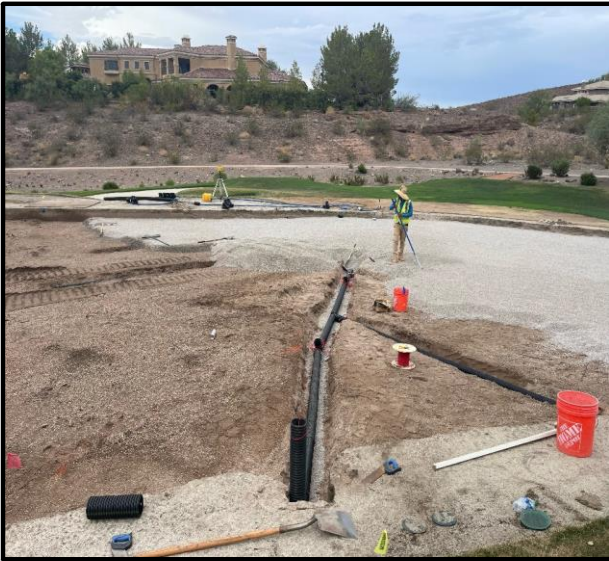
Draining #14 green.