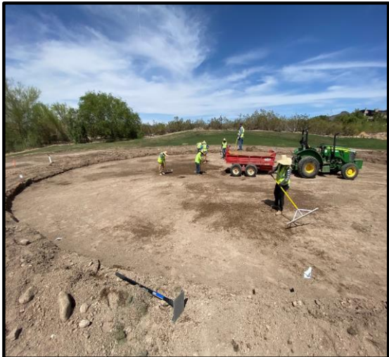
Filling holes in subgrade.