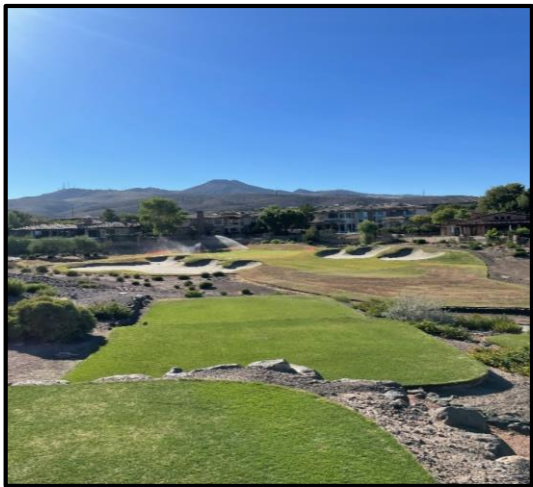
#14 green & fairway grassed.