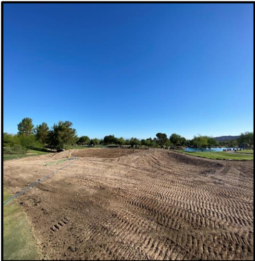
#5 new approach.