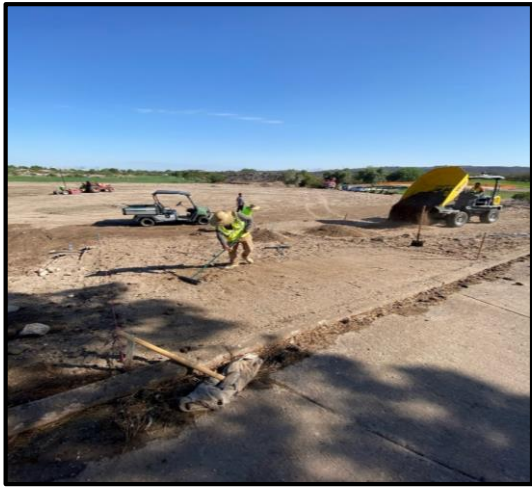
Prepping DR tee.