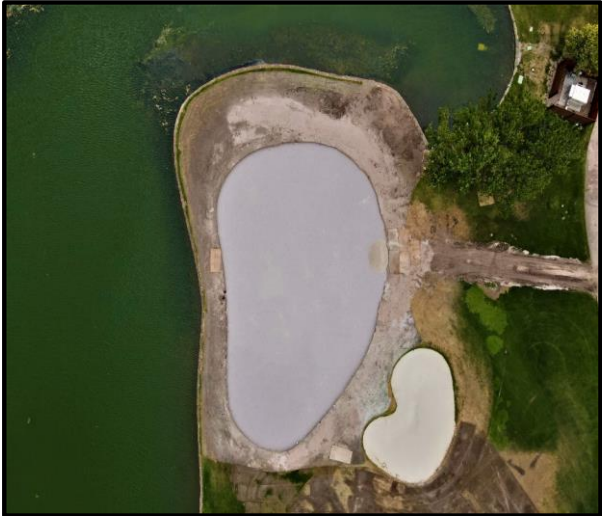
Complex #10 gravel layer installed.