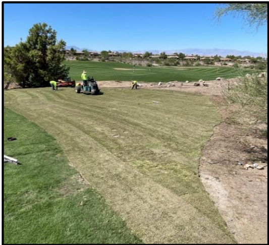
New chipping area on south chipping green.