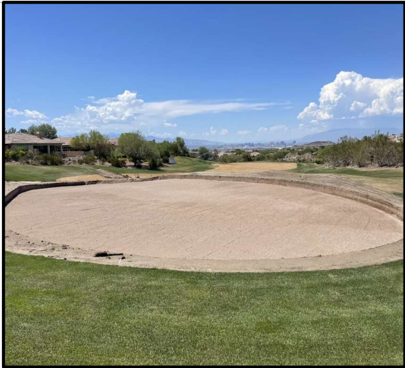
#13 green cavity