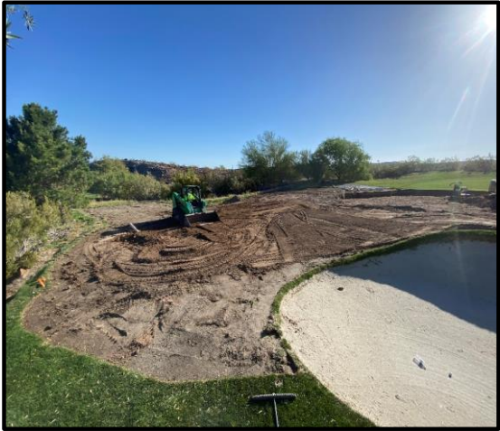
Backfilling bunker on South chipping green.