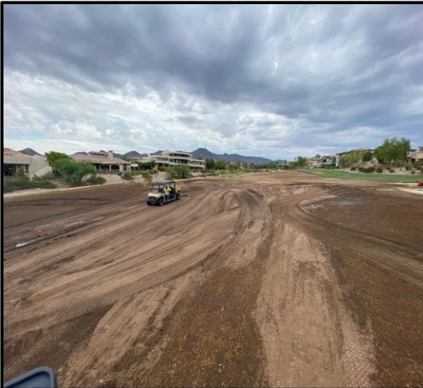
Prepping #5 fairway.