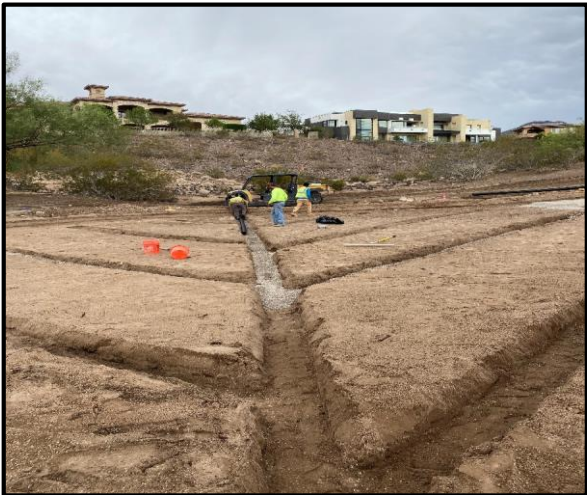
Draining #15 green.