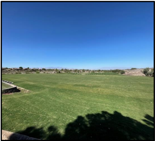
Driving range tee grassed.