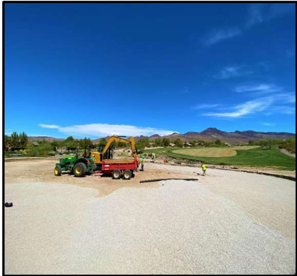
Draining #3 green.