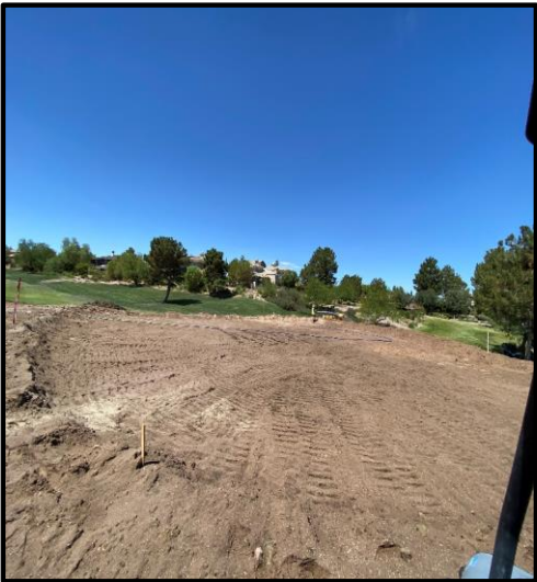
#5 greens cavity.