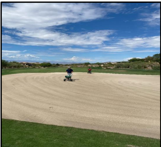
Anthem CC crew seeding #9 green.