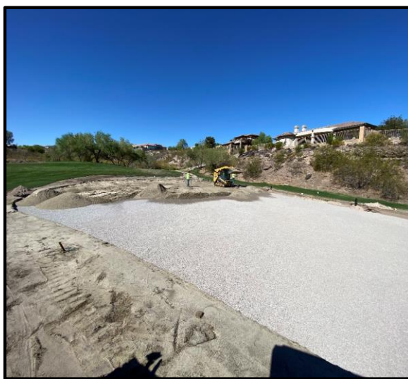
Installing greensmix on #2.