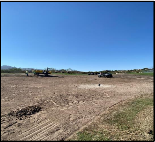
New swale on #8.