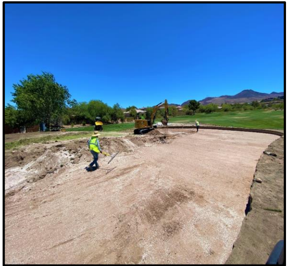
Coring out #10 green.