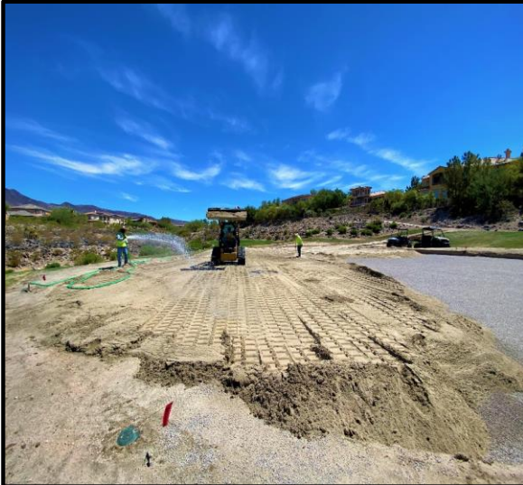
Installing greensmix in #4 green.