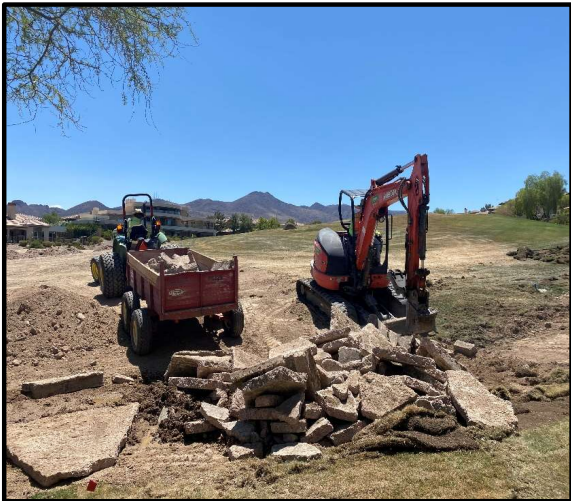
Cartpath Demo on #5