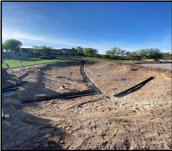
Draining #7 bunker