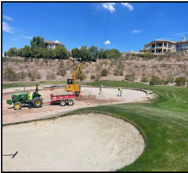
Draining #13 green.