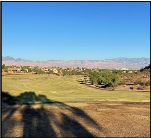
#18 fairway grassed.