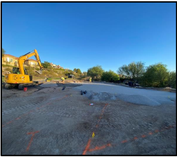
Draining #4 green.