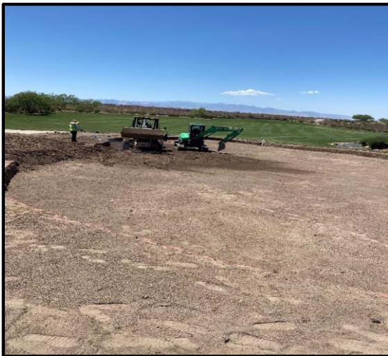
Shaping #9 green.