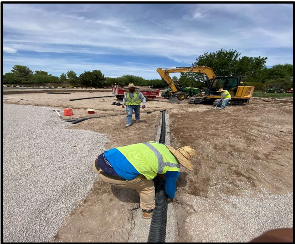
Draining #10 green