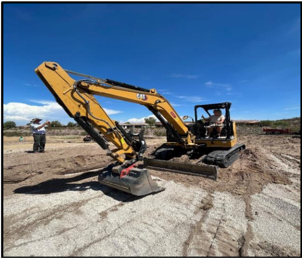
Shelley coring out #15 green.