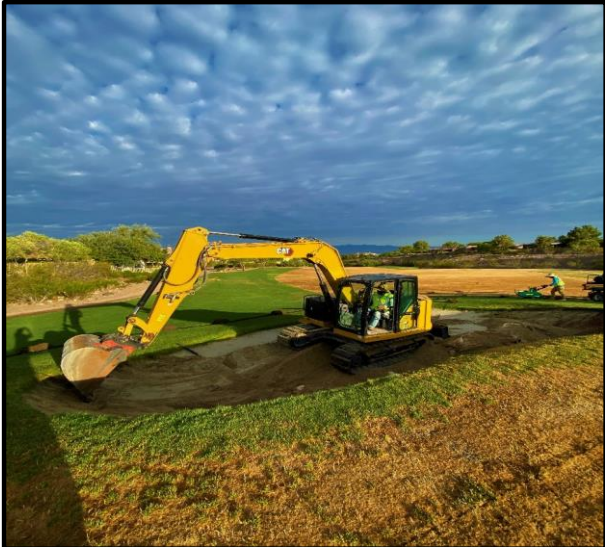
Shaping #15 bunker.