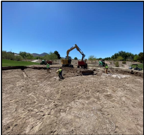
Coring out South chipping green.