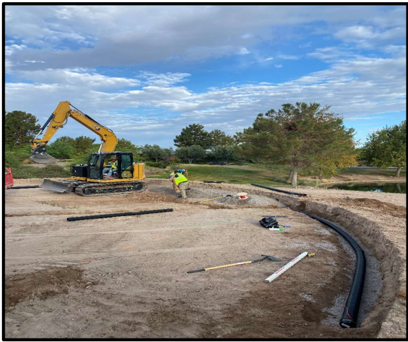
Draining #5 green