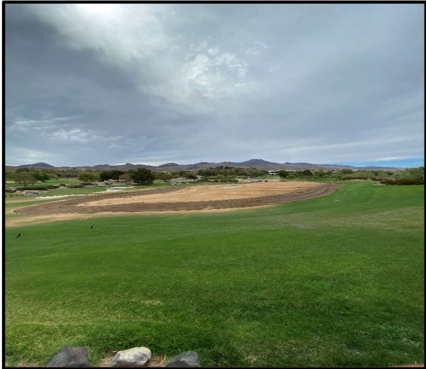
Frase mowing #9 fairway