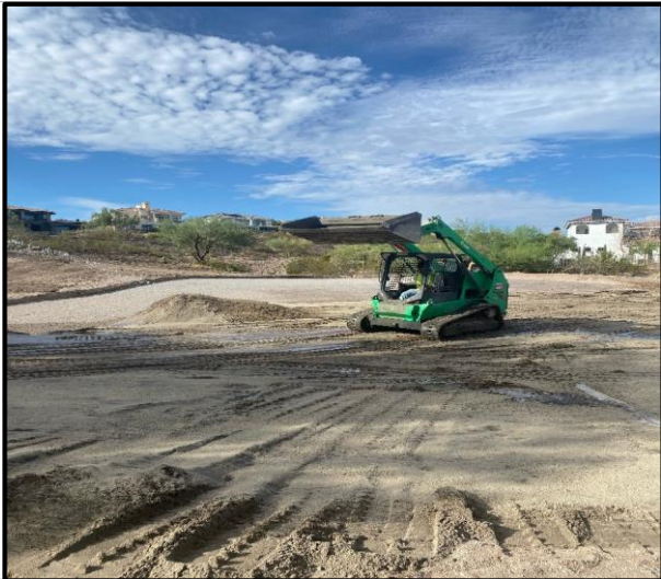
Installing mix in #15 green.