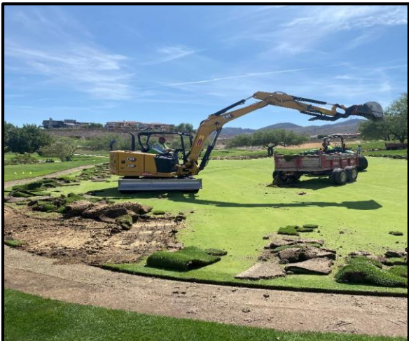
Coring out putting green.