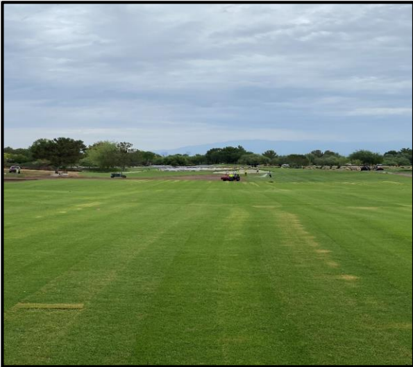
#5 fairway grassed.