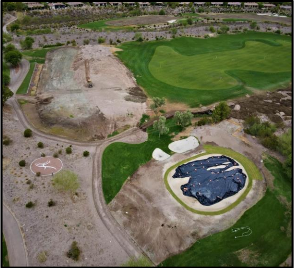
South DR tee & SCG in progress.