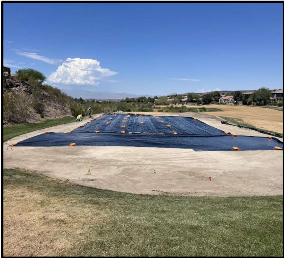
Covering #2 green with plastic tarp