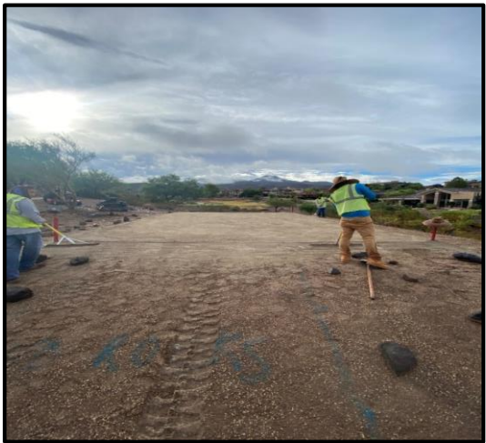
Prepping new tee on #14.