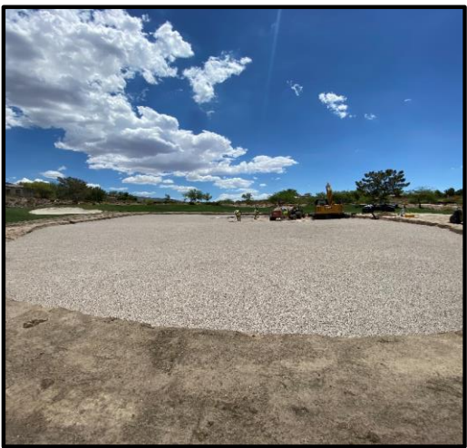
Installing drainage and pea gravel on #1 green.