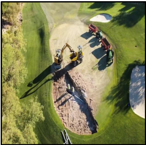
Coring out #7 green.