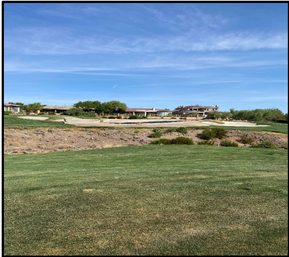
Covering #3 green with plastic tarp