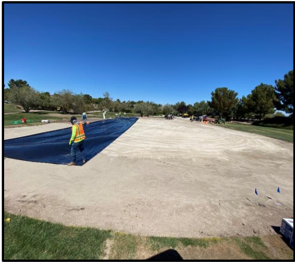
Covering North CG with plastic tarp.