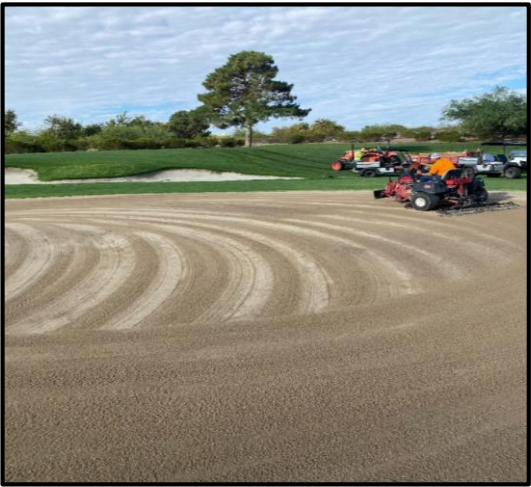
Prepping #9 green for seed.