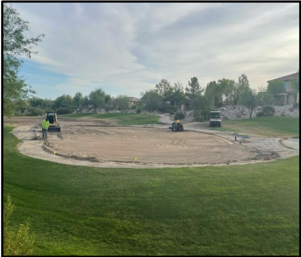
Floating #7 green.