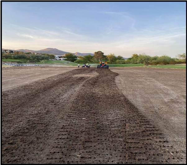
Anthem CC aerifing #9 fairway