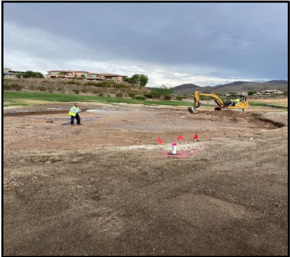
Coring out #18 green.