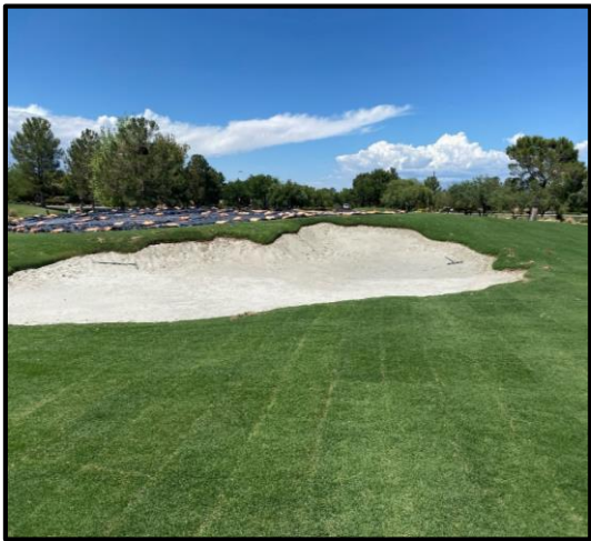
New bunker on #5.