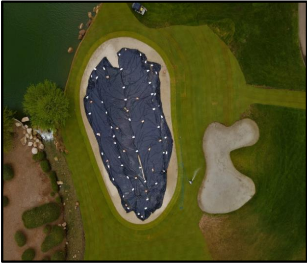
Complex #9 grassed.